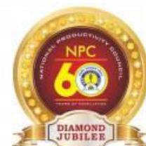
Productivity Week Celebration