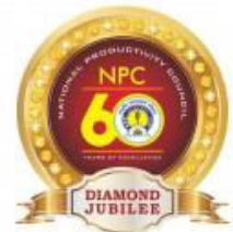
Productivity Week Celebration