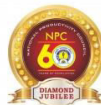
Productivity Week Celebration