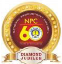
Productivity Week Celebration