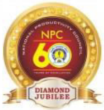
Productivity Week Celebration